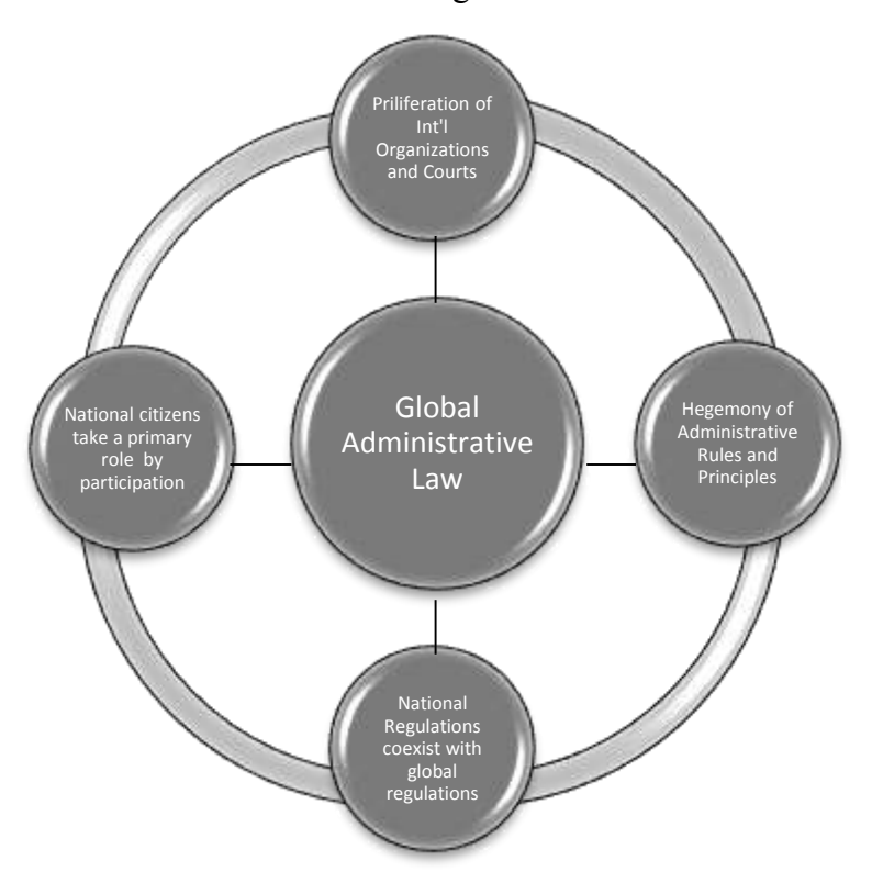
Figure 2 Global Administrative Law according to Cassese

As we see in the figure, a network of national laws, administrative rules and principles, national citizens, international organizations, and courts, all together play certain role in the emergence or creation of global administrative law. Moreover, Cassese believes such a coordination and consistency can lead the world to have a universal rule of law in the long term.