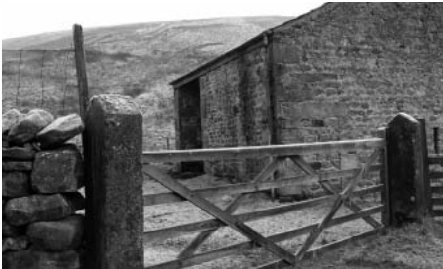
Fig. 9 Stone Barn