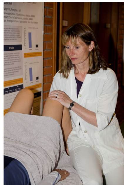
Fig. 2 Digital palpation of the pelvic floor muscles (reproduced with permission from subjects in the photo and photographer Andreas Birger Johansen)

normal nulliparous women [45]. Several groups have studied and defined levator damage on MRI when one or more of the following is present: absence of pubococcygeal muscle fibers in at least one 4-mm section, or two or more adjacent 2-mm sections in both the axial and the coronal planes [46]. The degree of injury can be assessed based on