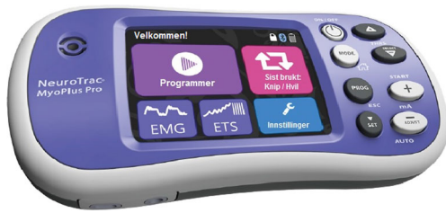
Fig. 7 Verity Medical NeuroTrac MyoPlus Pro surface electromyography biofeedback apparatus (also incorporating electrical stimulation

patient history, examination, review of laboratory data, and the opinion derived from such an evaluation [59].