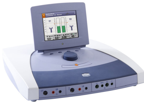
Fig. 9 Enraf-Nonius Myomed pelvic floor machine, including electrical stimulation

electrical stimulation of the tibial nerve, which lies behind the medial malleolus, using skin surface electrodes applied to the medial malleolar area (transcutaneous TNS) [98]. There are two main types of electrical stimulation with surface electrodes: