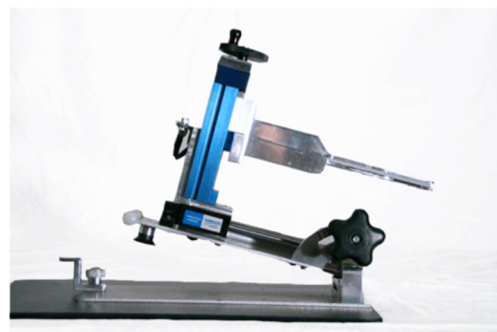
Fig. 6 Montreal, Canada, pelvic floor dynamometer (reproduced with permission from Chantale Dumoulin)

Diagnosis: the act or process of identifying or determining the nature and cause of a disease or injury through evaluation of