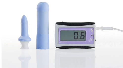
Fig. 3 Peritron manometer

the amount of muscle involved in the injury, with reasonable repeatability among different examiners in a single group [47]. More than half the expected muscle bulk is associated with the presence of POP [48].