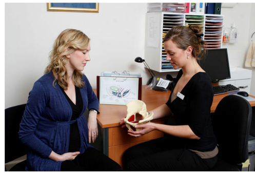
Fig. 8 Patient education of pelvic floor muscle function (reproduced with permission from Women's and Men's Health Physiotherapy )

categorized as: bladder training, timed voiding, habit training, and prompted voiding [71].