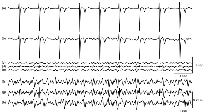
Fig. 1. (a) ECG from a 76 year old patient in sinus rhythm, P wave removed (b) ECG signal obtained by the addition of AA (c) and VA (a) ECG signal. (c) Original 10-second ECG simulated AA on VR. (d) Estimated AA with the ABS 3 method after applying a high pass filter with a cutoff frequency of 1 Hz. (e) Estimated AA with the single beat (SB) method after applying the same high pass filter. (f) Original AA of (c) amplified 4 times. (g) Estimated AA of (d) amplified 4 times; QRS MSE of 0.25 & JQ MSE of 0.08. (h) Estimated AA of (e) amplified 4 times; QRS MSE of 0.53 & JQ MSE of 0.47.

if they come from separate depolarization and repolarization wave clusters. These two factors may explain why the ABS 3 method obtains better cancellation results in the JQ intervals than the standard ABS based method without template modifications (ABS 1 ), see first and third columns of Table II; for the JQ intervals, the only difference between these two methods are their clusters. The third is related to the criteria used for template modification; modification by rotation and scaling of the ventricular templates is beneficial for the QRS complexes but not for the JQ intervals. The minimization of the Frobenius norm between the ventricular templates and the original complexes produces efficient results on the QRS complexes because, in the QRS intervals, the amplitude and the frequency contents of VA are greatly different to the ones related to AA. This explains the excellent results for both ABS based methods that apply these modifications to the QRS complex templates (ABS 2 and ABS 3 ), see columns 2 and 3 of Table I. However, it is not the case in the JQ intervals. The minimization of the Frobenius norm does not properly modify the JQ interval templates. This may explain why the ABS 1 method obtains better cancellation results in the JQ intervals than the ABS 2 , see first and second columns of Table II; for