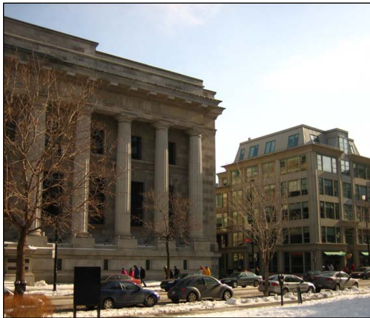
Figure 5. Ancien Palais de justice d’Ernest Cormier et bâtiment voisin. (Photo Jean-Claude Marsan, 2006)