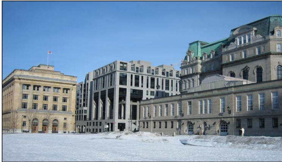
Figure 4. Le complexe Chaussegros-de-Léry avec, à gauche, la Cour municipale et, à droite, l’Hôtel de ville de Montréal.