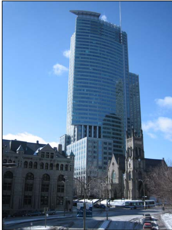
Figure 6. L'édifice IMB Marathon, place du Canada, avec, à gauche, la gare Windsor et, à sa base, l'église St. George.