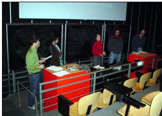
Présentation des étudiants, 10 mars 2006, Université de Montréal (C. Boucher, 2006)

Étudiants de 2 e cycle, Études canadiennes de l’Université Carleton / Graduate Students, Canadian Studies, Carleton University.