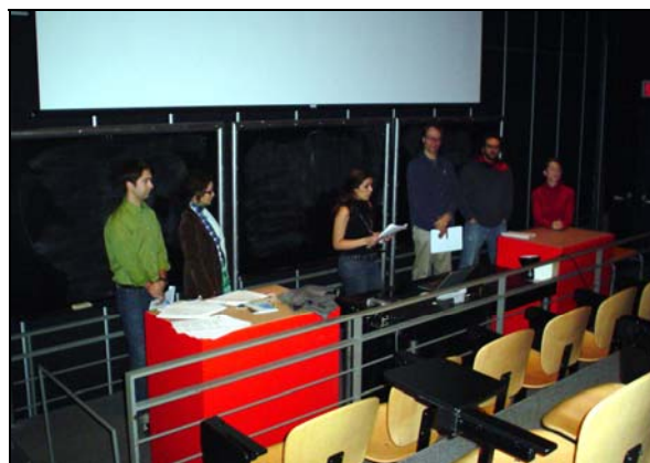
Présentation des étudiants, 10 mars 2006, Université de Montréal (C. Boucher, 2006)

Étudiants de 2 e cycle de l'École d'Architecture de l'Université de Montréal / Graduate students from the School of Architecture at the University of Montreal.