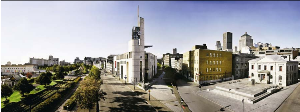
Figure 2. Le Musée d’archéologie et d’histoire de Pointe-à-Callière avec, à droite, la place Royale et l’ancienne Maison de la Douane.