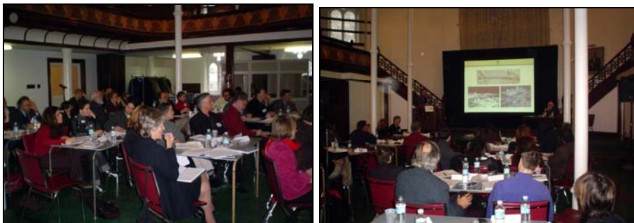
Table ronde organisée par la Chaire de recherche en patrimoine bâti, Faculté de l'aménagement, Université de Montréal

Round Table organized by the Canada Research Chair on Built Heritage, Faculty of Environmental Design, University of Montreal