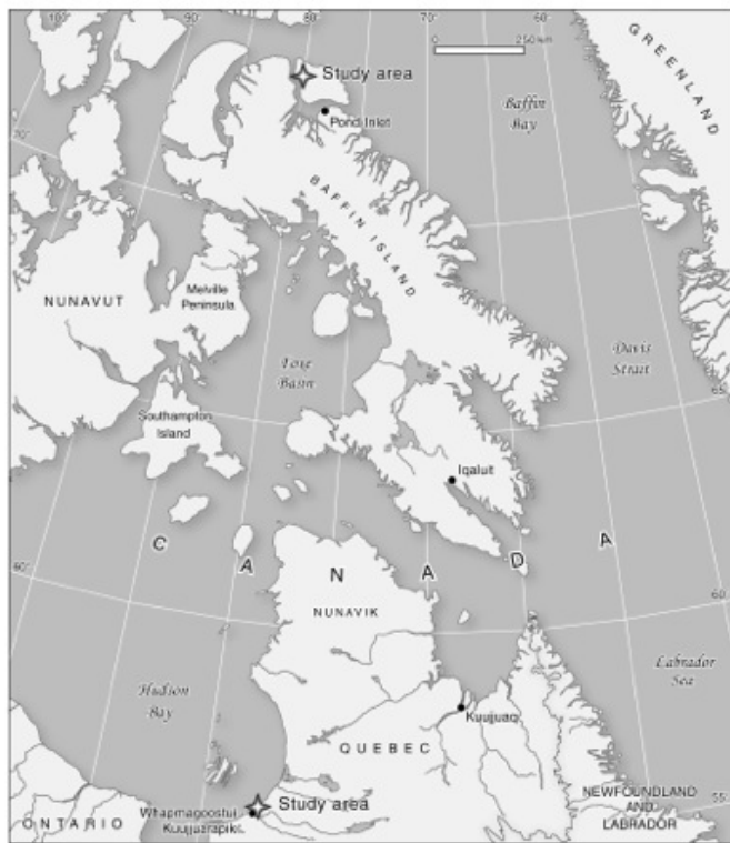
FIGURE S1. Map of the study area, showing Kuujuarapik-Whapmagoostui (Quebec, Canada) and Bylot Island (Nunavut, Canada).