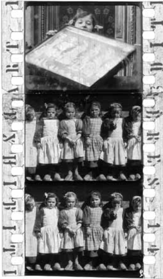
Fillettes de Bretagne, Pathé, France, 1909