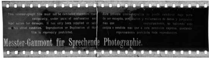
[Trommelkünstler], Gaumont/Messter, France/Germany, c.1907

reduced to a limited range of fields. For the same reasons, some colors (for instance, “orange” and “amber”) have been merged into a single field. Color assessment and definition should therefore be considered as approximate. In the event that a more accurate analysis is required, a direct examination of the original frames is strongly recommended.