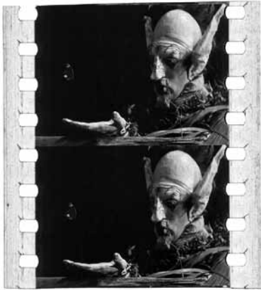
A Trip to Mars , Edison, US, 1910