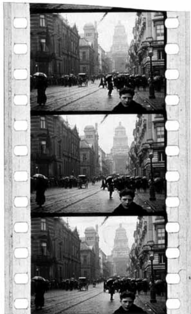
Bruxelles , Nordisk, c.1908

Collection was rescued by David Francis, then Curator of the National Film Archive at the British Film Institute in London. As of 2011, 1,158 of them are reported to survive in some form at the BFI National Archive. 2