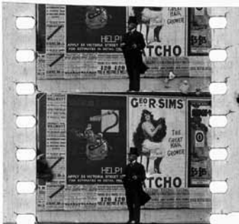
Unidentified film, c.1905