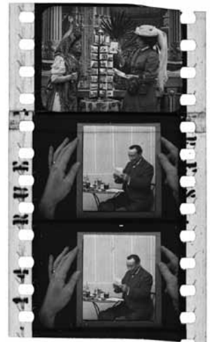
Vues d'Espagne en cartes postales, Pathé, France, 1907