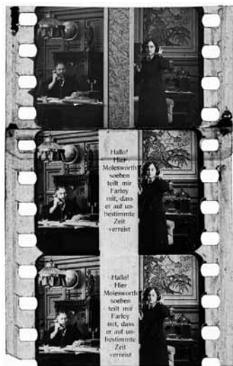
Unidentified film, c.1910